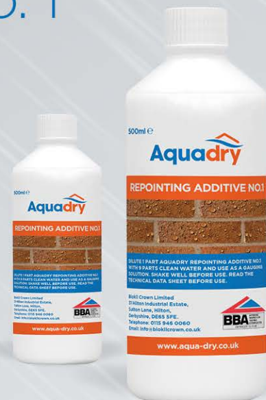
The reduction in water absorption of repointing masonry after the addition of Aquadry Repointing Additive No. 1

Test work demonstrates that the addition of Aquadry Repointing Additive No. 1 greatly reduces the water absorption of the mortar as shown in the graph below: